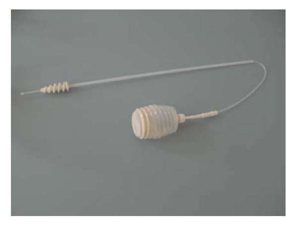
Figure 1. A set for uterine content sampling and YCW or Lotagen application

Before treatment, samples of uterine flushing were collected by means of an especially designed catheter for sows (Figure 1) which enables sampling and minimizes the risk of uterine wall perforation (General Medic, Beograd, Srbija). Bacterial count, types of bacteria, bacterial, neutrophyle and eosinophyle presence on the stained smears (May Grünwald-Giemsa method) were determined. Samples were collected again from the same animals two to five days after therapy and the same laboratory tests were repeated.